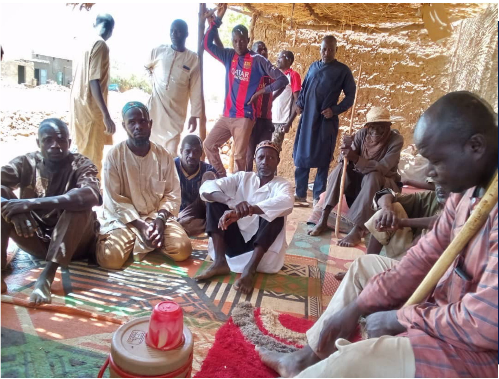
Focus Group Discussion with men from Tillabery .region